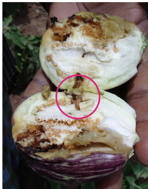
An FSB larva that has bored into an eggplant fruit, causing considerable damage and rendering it unfit for market.