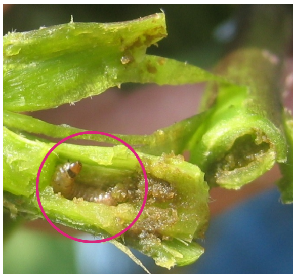
An FSB larva that has bored into the shoot of an eggplant, thus causing the plant to wither.

The eggplant fruit and shoot borer (FSB) is the most destructive insect pest for eggplant in South and South East Asia. The FSB is a small larva that bores inside shoots, resulting in the withering of the shoots. It also bores into and feeds on young and maturing fruit, making the fruit inedible and unfit for market. Damage from the FSB starts at the nursery stage and continues until harvest.